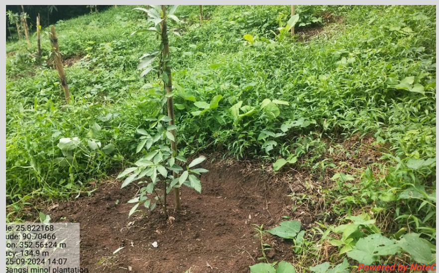
Bangsi Minol Plantation, Resubelpara Block, NGH