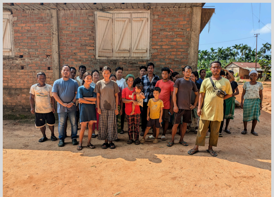
Activities conducted in Selsella Block: FGD and PRA