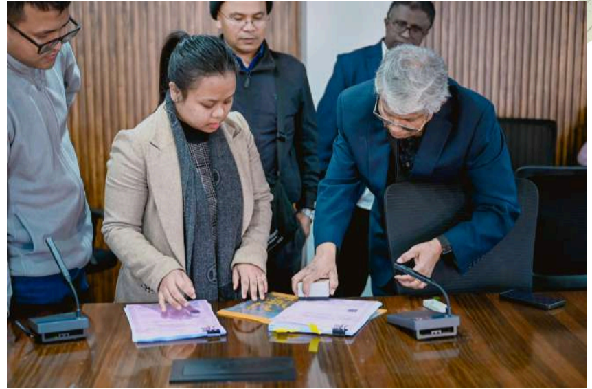
Staff Meeting at SLM Conference Hall

A staff meeting was held on December 3rd, 2024 , at the SLM Conference Hall. The agenda included onboarding NGOs, signing MoUs, conducting financial training, and discussing upcoming block-level positions to be filled.